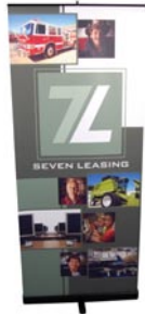
Quickscreen 1 Retractable $595