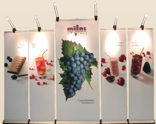
Quickscreen 3 Combo $3775

As with all of our products and services, we strive to offer quality, durable, well-designed displays and display graphics. Our in-house graphic design and production team work hard at researching and developing graphic mural panels that last long and fit properly, while still maintaining the highest image quality. Likewise, our product teams search out displays that are simple to use, and last long enough to offer a lifetime warranty. Above all, we pride ourselves on our customer service and our end-user's positive feedback, so please feel free to contact us for more specifics about our displays and graphics.